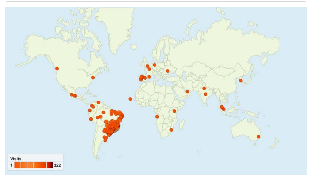
Figure 2 . Spatial distribution of the 616 cities from where consultations to Ambi-Água originated in the two month period analyzed (June 15 on August 15, 2008).

BATISTA, G. T. Sétima edição da Revista Ambiente e Água. Ambi-Agua, Taubaté, v. 3, n. 2, p. 3-4, 2008. (doi:10.4136/ambi-agua.47)