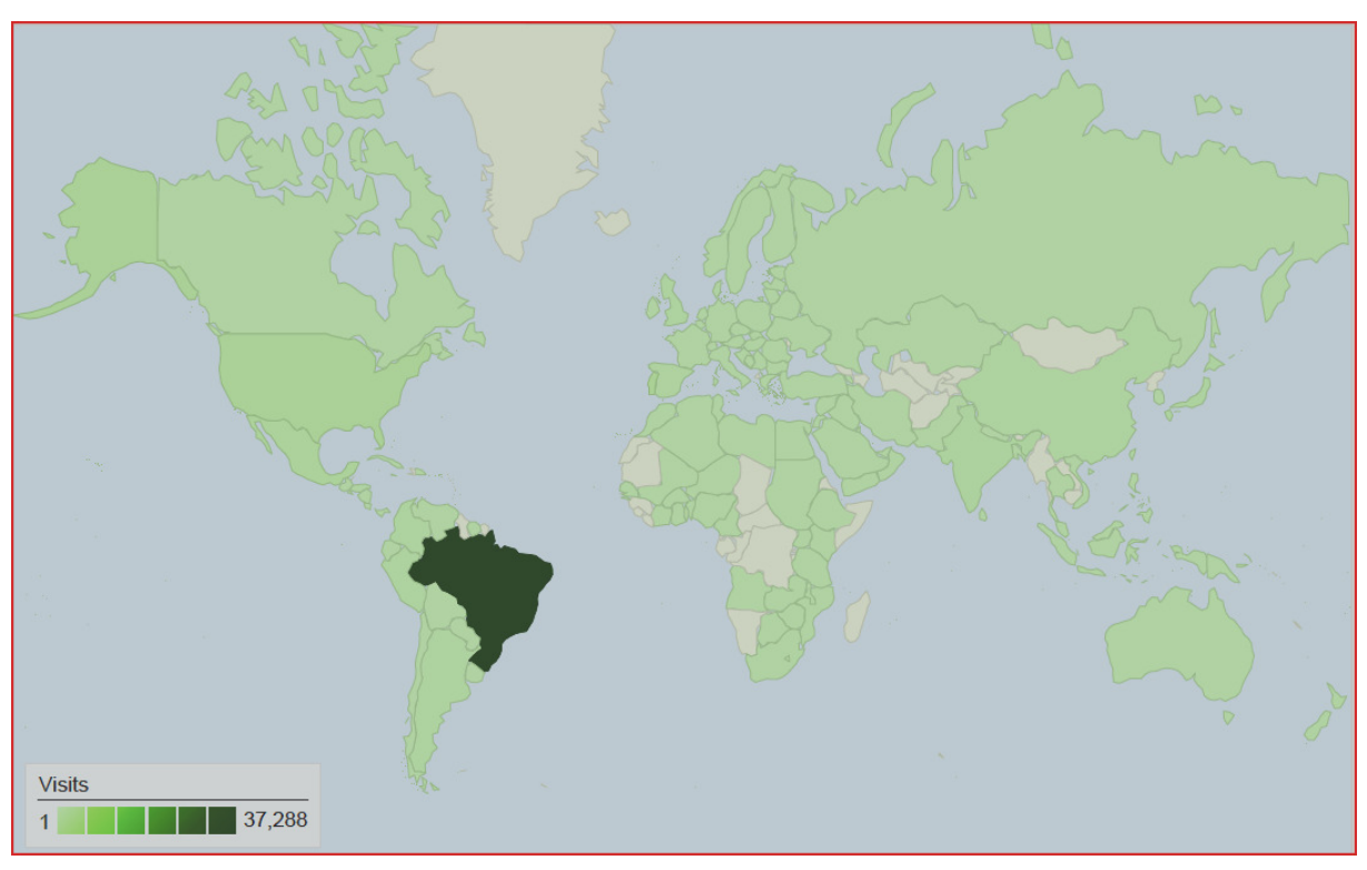
Figure 1. Countries from where Ambi-Agua has been accessed in a period of September 15, 2007 - August 25, 2009. Total of 45,676 visits from 138 countries/territories.