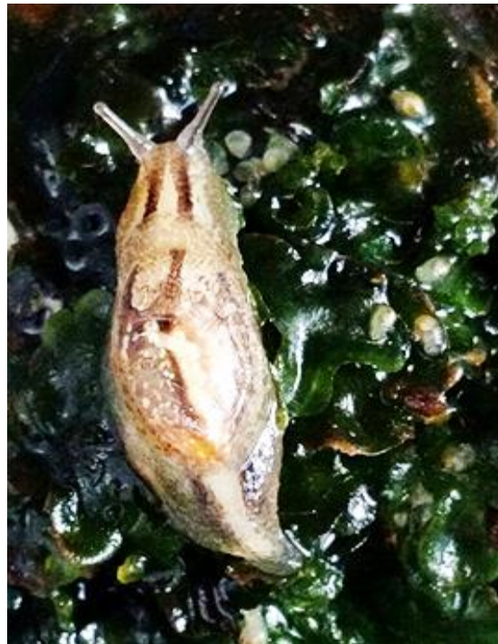
Figure 3. Omalonyx matheroni sampled in the Ribeirão dos Mottas.

Symbiosis interactions including sponges is widely reported, in fact they capability to establish a great diversity of relationships (mutualism, commensalism and parasitism with unicellular and multicellular organisms) (see Ávila et al. , 2007) is one of their more interesting characteristics. The presence of individuals of four insect families pointing out the importance of R. inesi on the life history of these animals, as oviposition substratum (Huggibs, 1980), shelter and as source of food (Stoaks et al. , 1983).