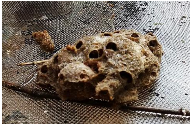
Figure 2. Radiospongilla inesi sampled in the Ribeirão dos Mottas.